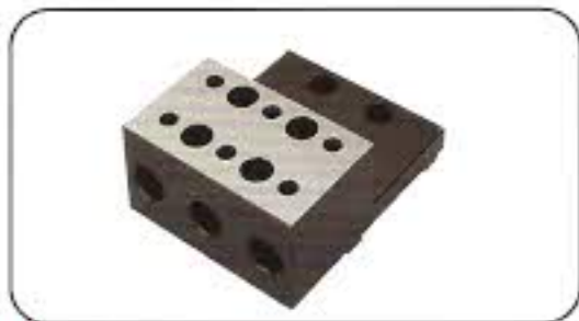
▲ 3刀位內徑刀座 (選配) 3-position ID tool holder (option)