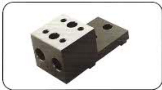
▲ 雙刀位內徑刀座 (選配) 2-position ID tool rest (option)