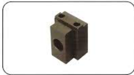
▲ 單刀位內徑刀座 (標配3個) 1-position ID tool rest (standard, 3 pcs)