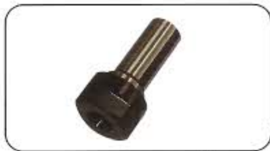
▲ 固定式內徑刀ER20筒夾座含螺母 (選配) Fixed ID tool ER20 collet holder with nut (option)