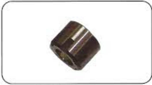
▲ ER16 筒夾螺母 (標配, 3個) ER16 drill collet nut (standard, 3 pcs)