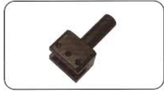
▲ 20mm 圓柄單刀位外徑刀座 (標配, 1個) Ø20 shank 1-position OD tool holder (standard, 1 pc)