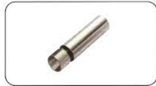
▲ 固定式內徑刀ER16筒夾座 (標配3個) Fixed ID tool ER16 collet holder (standard, 3 pcs)