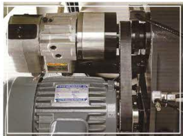
▲ 主軸筒夾開閉用油壓缸 (適用於機型 G-32HA) Hydraulic cylinder for spindle collet OPEN / CLOSE (available with model G-32HA)