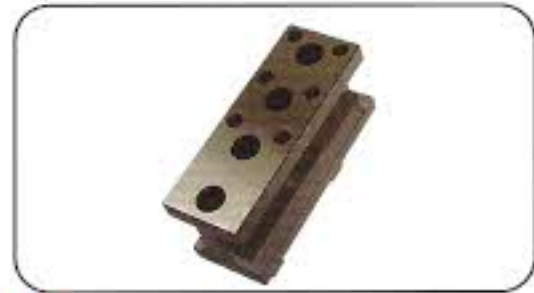
▲ 雙刀位外徑刀座 (刀柄軸向安裝) (標配, 1個) • 刀具中心高度無法調整 • 2-position OD tool holder (shank axially mounted) (Standard, 1 pc) • Note: Tool center height not adjustable