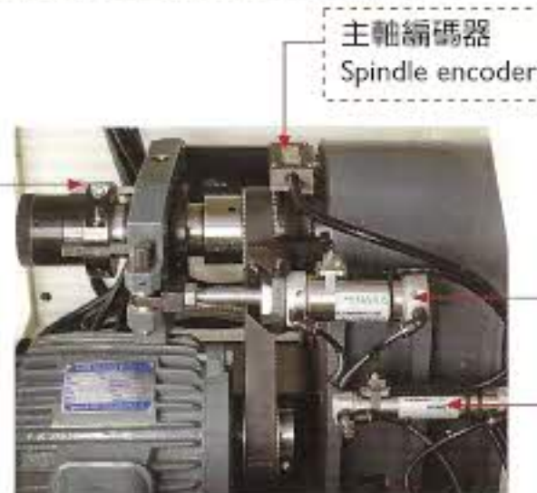
開閉爪驅動用氣缸 Air cylinder for toggle driving